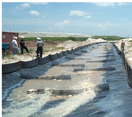
Floc Logs® installed between wattles for increased mixing and reaction.